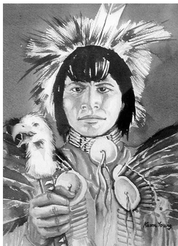
Top: "October Falls," oil, by Beverly Morgan . Bottom: "Dances with Eagles," watercolor, by Karen Young .

watercolor and oil are also included. The Heritage Club is located at 111 Washington St. NE.