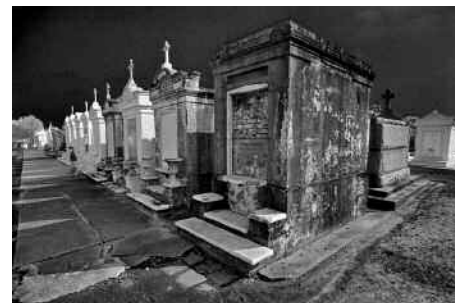
"Cemeteries" by Walt Schumacher

In the recent Huntsville Photographic Society competition on "Cemeteries," Walt Schumacher received First Place in the Black& White division, for a picture taken at an above-ground cemetery in New Orleans, BF (Before the Flood). Congratulations Walt!