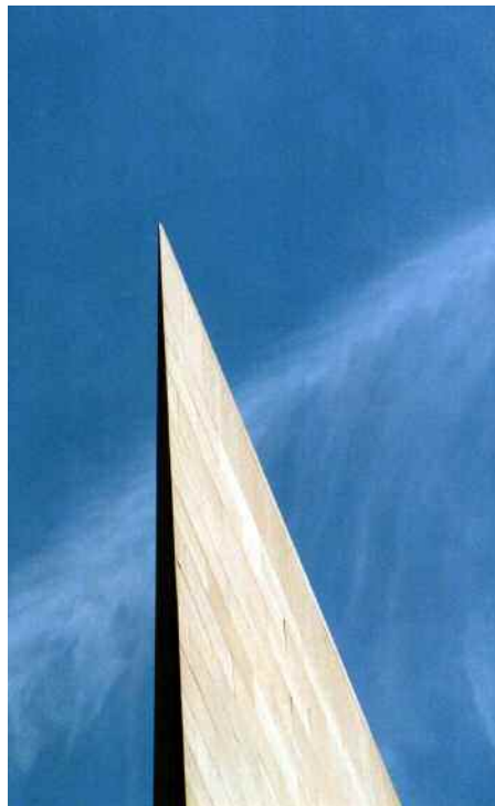
"East Wing" by Fred McBride

Fred McBride is a freelance photographer who moved to Huntsville after spending